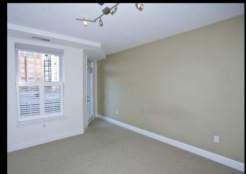
Walk-out to Balcony