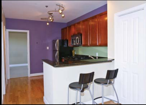
Kitchen Breakfast Bar