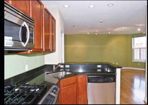
Stainless Steel Appliances